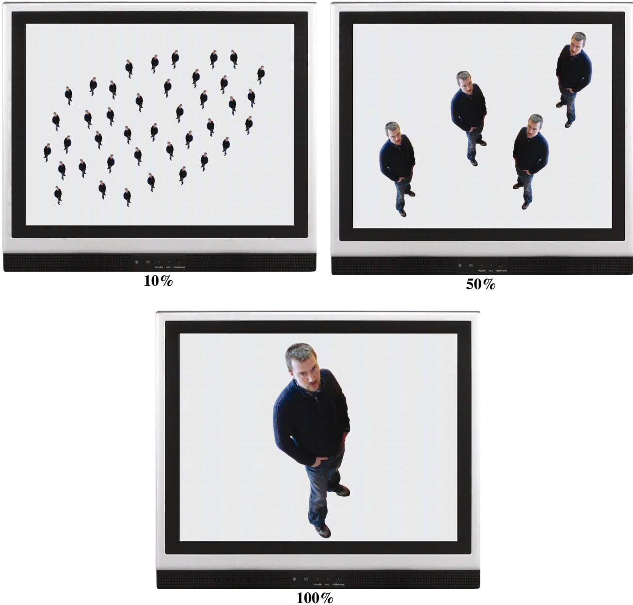
Figure 1 - Graphic Example of Clause 6.2 requirements

Where digital CCTV technology is used and the intended target is a person or persons the equivalent level of quality shall apply.